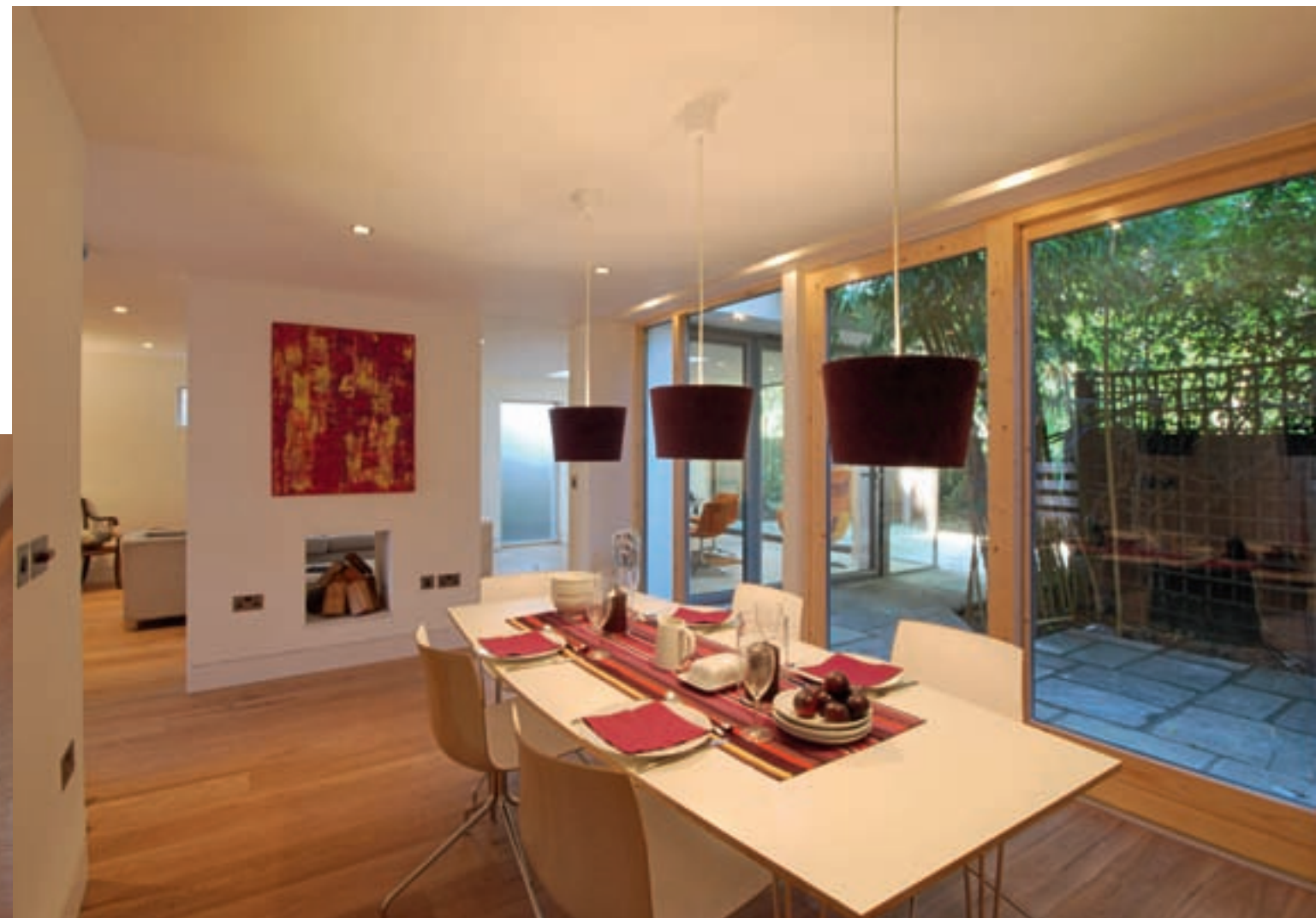
Left: Oak and white-gloss cabinetry are teamed together for a fresh, modern kitchen design that's also warm and welcoming Above: The dining table has been positioned in such a way that it can engage with the garden and living area while also maintain a close proximity with the kitchen for easy transferral of food and dishes Below: Sliding glass doors extend across the rear of the house, allowing the living and dining areas to merge with the garden and facilitate a modern, indoor-outdoor lifestyle