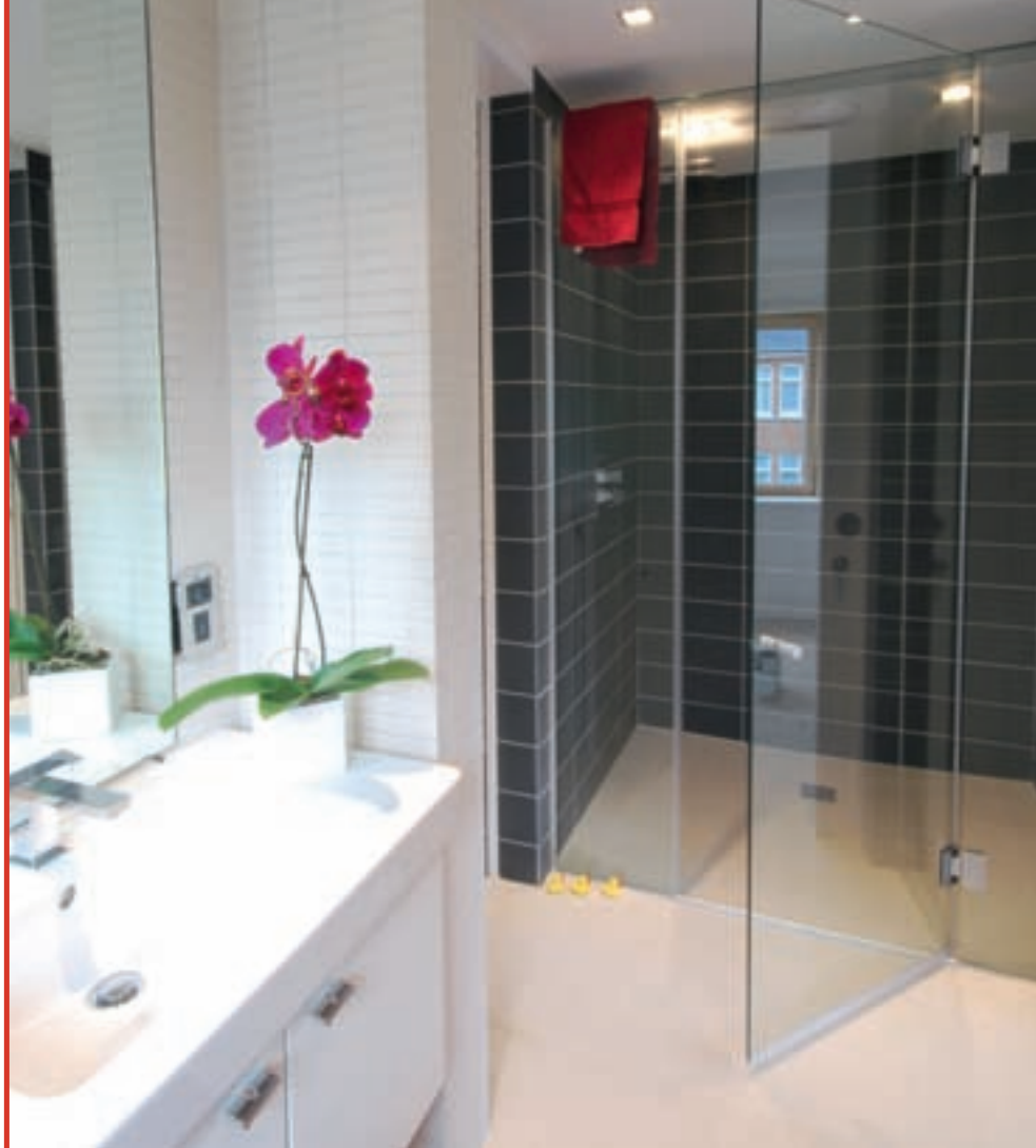
Above: Luxurious black tiles highlight the shower area and provide a striking contrast to the white porcelain walls and cream flooring in the guest bathroom

A similar kitchen would cost around £20,000, similar bedroom around £1500 and a similar bathroom around £10,000